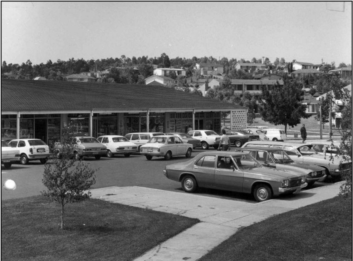
Lyons shops – there has been little investment in the shops and surrounds since the establishment of the shops